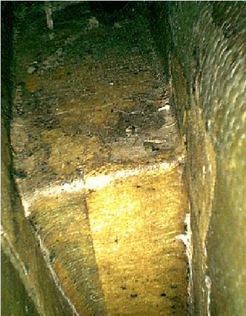
Looking through the access hole down and a bit forward. This is looking straight into the corner of what is the encased ballast. The shallow bilge runs toward the top of the picture across the encased lead. The deep bilge is toward the bottom of the picture.