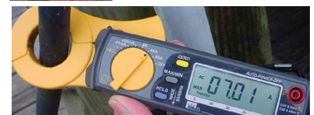
Top: An inexpensive circuit tester. Bottom: This clamp meter shows a 7-amp difference between the current going into the boat and coming out.