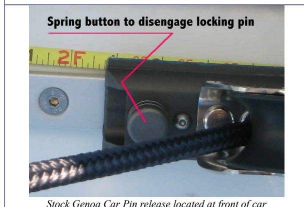
Stock Genoa Car Pin release located at front of car