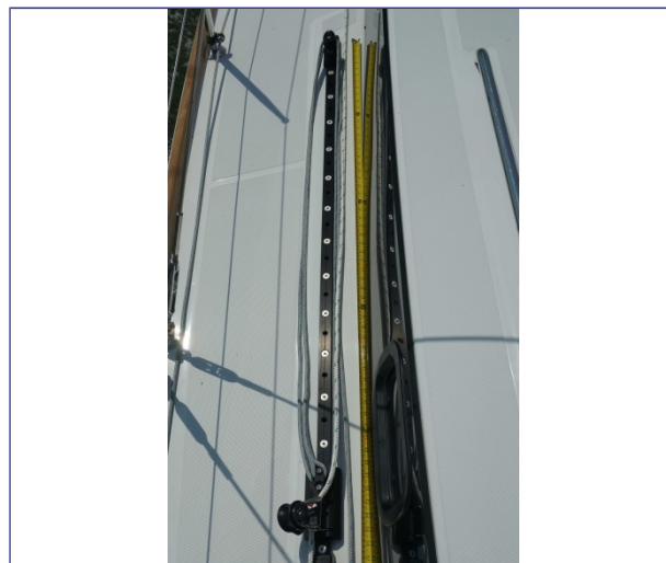
Measure car location from forward end of genoa track. (note custom adjustable lead system)

By marking the location of the cars so that they coincide with the reefing marks at the tack of the genoa you will take the guesswork out of setting the leads when reefing. The lazy genoa car can quickly and easily be moved forward to the pre-marked location and then during a slow tack the genoa can be reefed to the coinciding mark at the tack. The sail trim will be properly set on the new tack. When measuring the lead positions (as described below) you need to mark the track at the aft edge of the genoa car. You can do this with permanent marker, tape or some sort of self-adhesive ‘dots’. The marks should be on the deck as track mounted tape/marks can be rubbed off by the car.