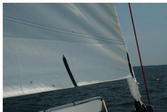
Genoa furling to first tack reefing mark