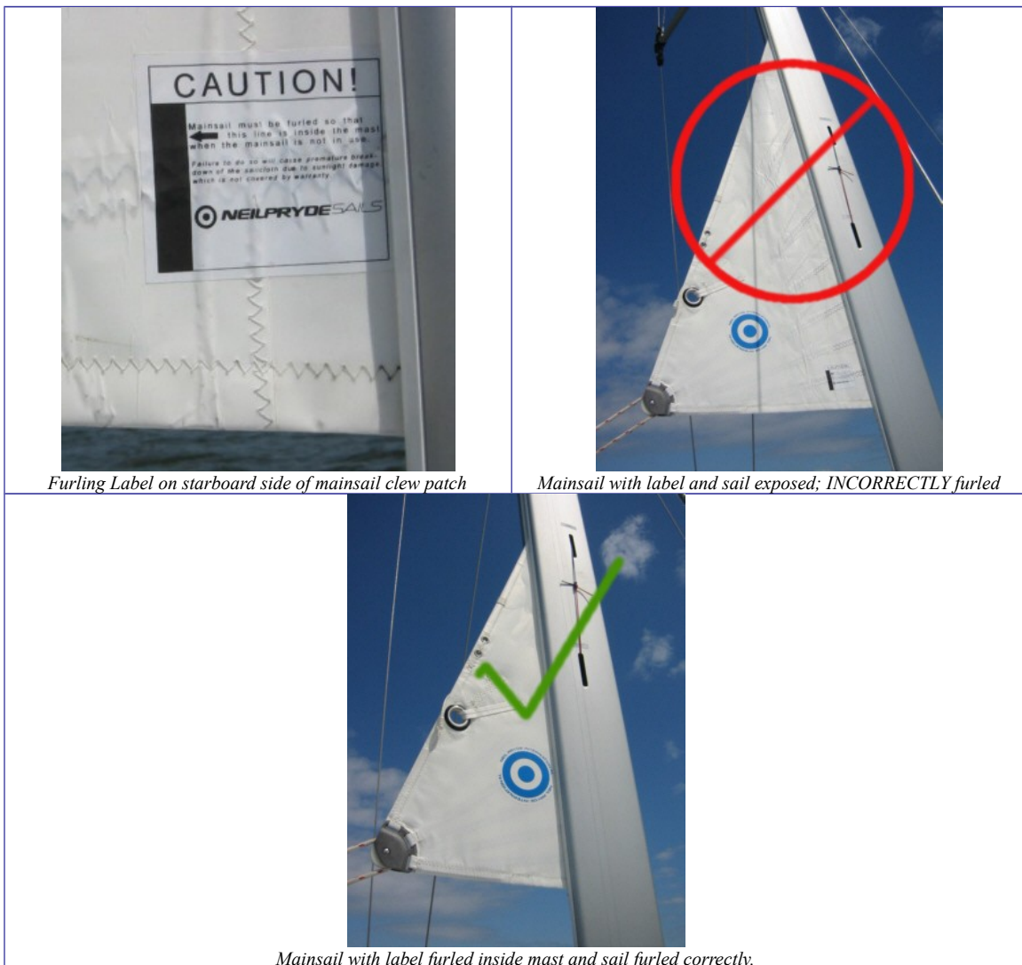
Furling Label on starboard side of mainsail clew patch

Roller Furling Mainsails are equipped with a small label on the starboard clew of the sail. This is designed as a 'marker' that will indicate when the mainsail is furled inside the mast far enough so that the U.V. cover on both sides of the sail will protect the sail. It is imperative that the sail be furled so that the label is clearly inside the mast, thus protecting the sailcloth from harmful U.V. If you do not take care in this regard, your sail will be weakened and may be permanently damaged in a short amount of time. Make sure this furling label is inside the mast when furled!