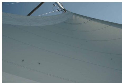
Genoa trimmed up properly with one reef.