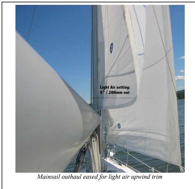
Mainsail outhaul eased for light air upwind trim