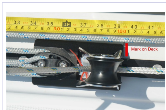
Back of car at 39.5" for full size genoa

Occasionally, you might find that the leech flutters a bit. If this happens, it's usually that the sheet tension is not tight enough (you need to winch the sail in a bit tighter). However, if the boat becomes over-powered (heeling excessively), you should consider reefing the sail at this time. Assuming you have the leads in the right location and the sheet tension is correct, but the sail still has a bit of flutter, you should adjust the leechline to keep the leech from fluttering.