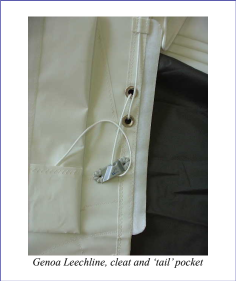
Genoa Leechline, cleat and ‘tail’ pocket

The following photo shows the leechline pocket opened to reveal the leechline, snubbing eyes, cleat and the ‘tail’ pocket. The snubbing eyes help to take the load from the line making cleating and un-cleating an easy task. The ‘tail pocket’ is on the inside of the leechline cover and you can put the excess leechline tail into this pocket before closing the cover. To adjust, take up the line by pulling downward just above the eyelets, taking up the slack in the line just below the cleat. Pull the line until the flutter stops. Cleat the line and insert the tail into the pocket and close the flap.