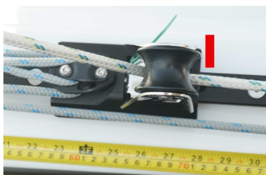
Car location when reefed to the first mark.